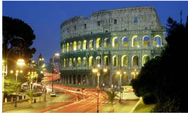
All lit up ... The Colosseum in Rome at night

The Guardian, Saturday April 19 2008 Article history